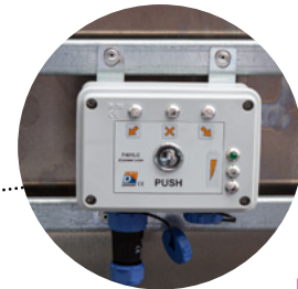
Control panel (optional remote control)